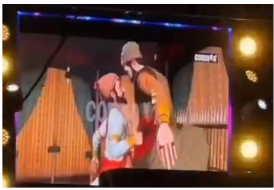
At the Shiva Jayanti rally, Hindu nationalists screened films of Shivaji and played derogatory music outside a mosque, using the event to provoke and intimidate local Muslims.(The Muslim (X))