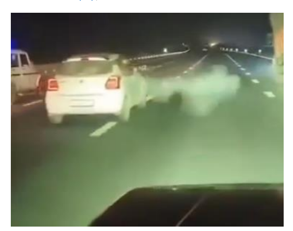
Cow protectors firing with modern weapons in the name of cow protection. It is worth noting that many Muslims have been killed in the name of cow protection.( The Muslim (X))