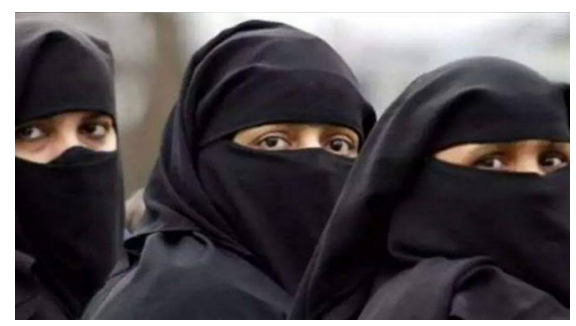
Three Muslim women in Srinagar's

Four girls skip Uttar Pradesh Board Hindi exam after being asked to remove Hijab. This happened before the commencement of the paper at the Sarvodaya Inter College Jaunpur. The girls returned home with their families, said officials. (Hindustan Times)