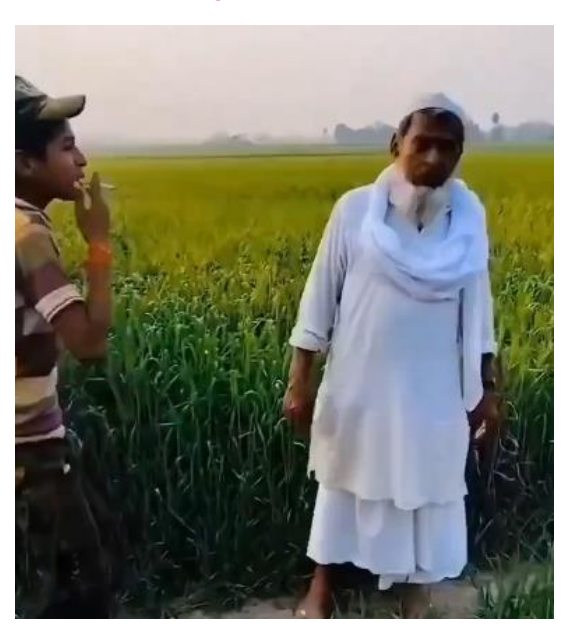
An elderly Muslim man was harassed during a religious pilgrimage.( The Muslim (X))