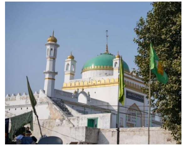
Uttar Pradesh, Sambhal Police remove loudspeakers of Shahi Jama Masjid, Imam gives prayer call from the rooftop.