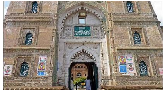
Management Committee Atala Masjid.